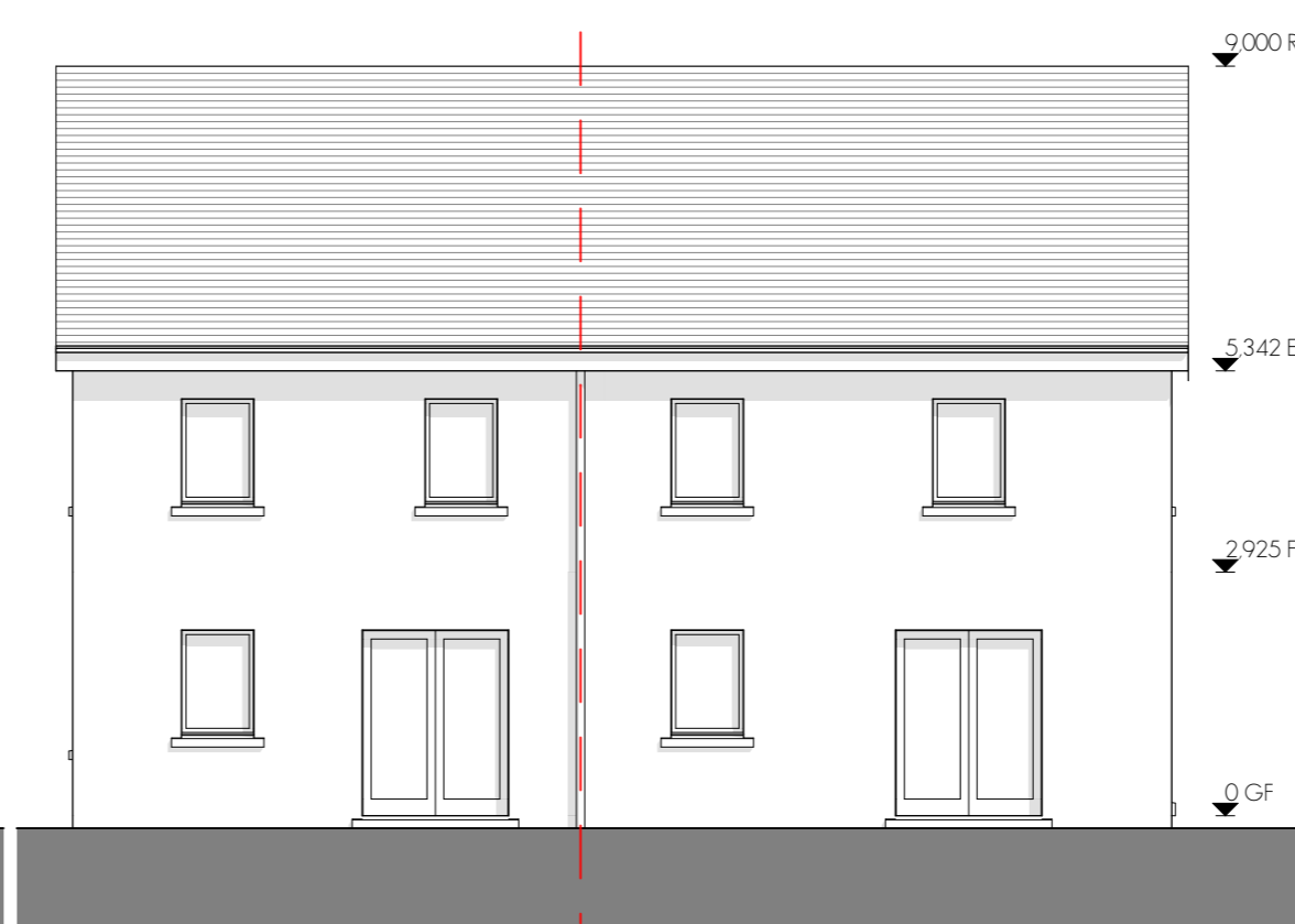
REAR ELEVATION - B4/A3