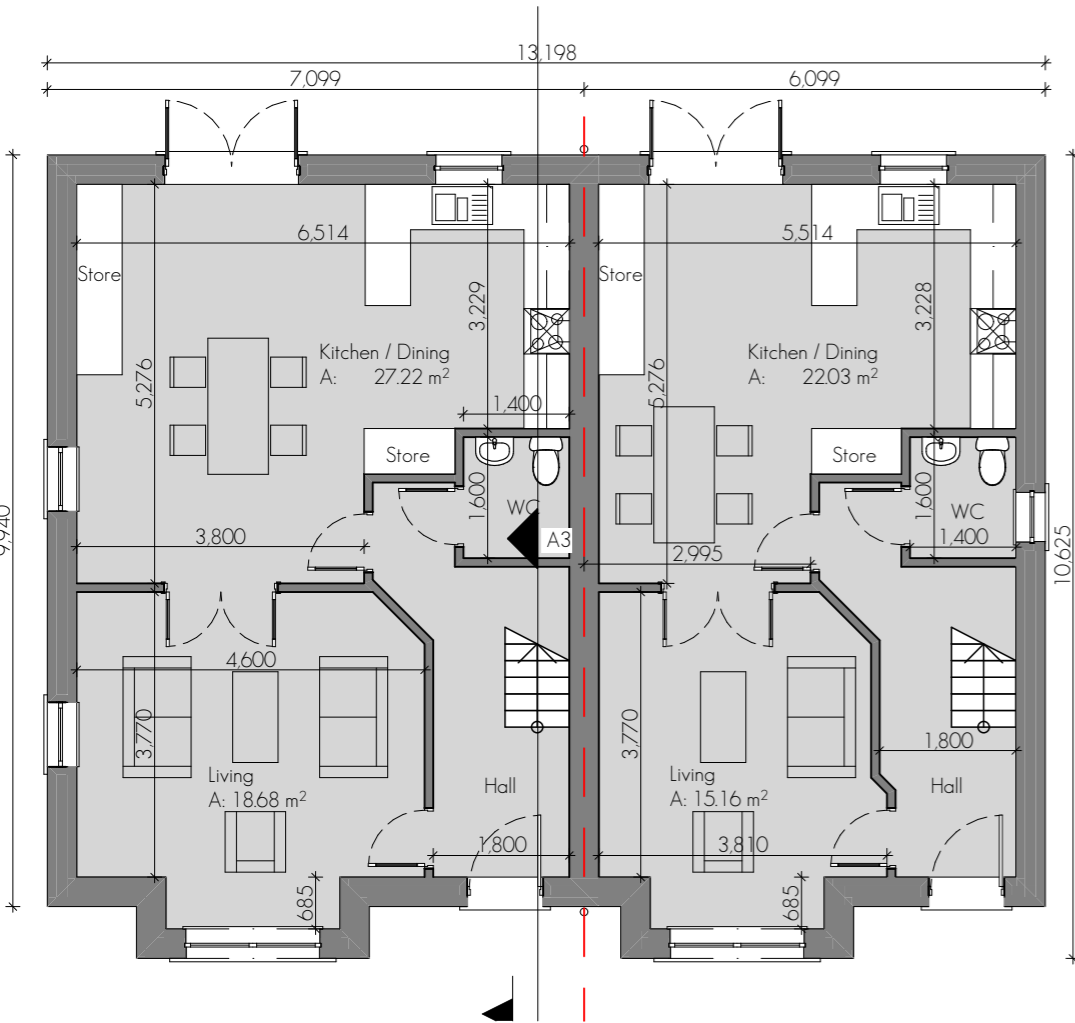
GROUND FLOOR- A3/B4

CANOPY: flat roof canopy in zinc/ lead/ powder coated aluminium