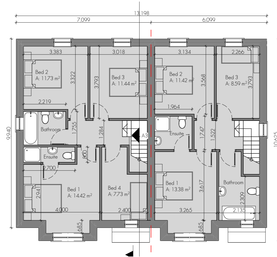
FIRST FLOOR - A3/B4