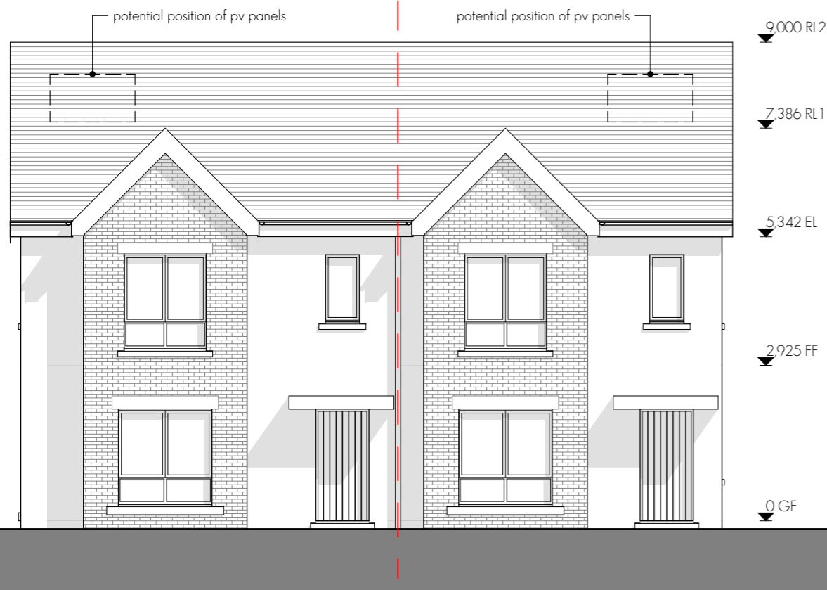
FRONT ELEVATION - A3/B4

THIS DRAWING IS FOR PLANNING PERMISSION PURPOSES ONLY. FURTHER DRAWINGS AND STUDIES WILL BE REQUIRED FOR CONSTRUCTION AND TO ENSURE COMPLIANCE WITH RELEVANT BUILDING REGULATIONS AND STANDARDS. NOTE: PLEASE REFER TO THE SITE LAYOUT DRAWING FOR ALL FFLS AND THE NORTH POINT ORIENTATION